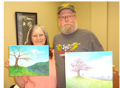
Art therapy students